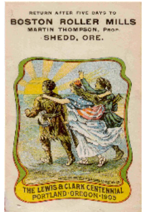
Lewis & Clark (with or without the return address)

See the price list for all items (07/01/2010). Art Cards, Postcards, Historic Mill Photos, Aprons, Sweat Shirts, Caps, and Mugs are also available.